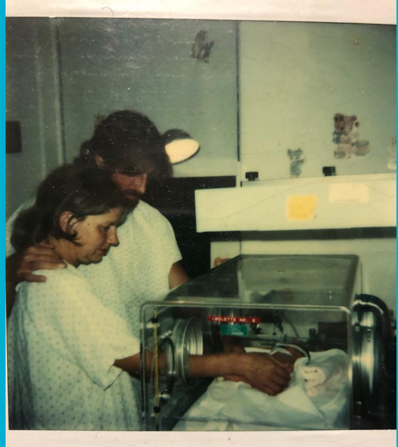
Me and my parents, 1979